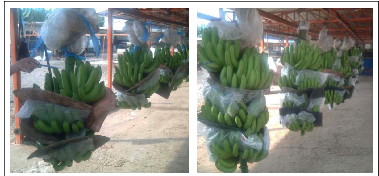
Banana bunches produced in a commercial farm in Ecuador under conventional methods using pesticides on the left, and under a 100% organic integrated management that includes the use of probiotic bacteria on the right

Microbes in the soil have many functions, and they are well known for recycling nutrients such as nitrogen and phosphorus. This recycling allows a whole array of microbes to proliferate in the soil. Bacteria are the organisms with the highest proportion of nitrogen in their tissues; their C/N ratio is 3. The immediate bacterial grazers such as protozoa or nematodes have a C/N of 30 to 50, so they need to excrete nitrogen after grazing on bacteria, and this nitrogen is in the form that plants assimilate best. The reason plants excrete through the roots up to 25% of the carbon they fix is to attract and feed