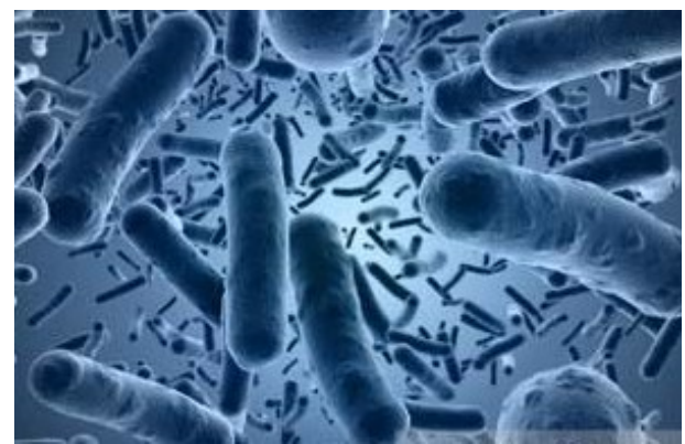
Bacillus bacteria used as probiotics in agriculture and aquaculture applications

I continued working with defined, single strains of beneficial microbes. Even though consistent beneficial effects under laboratory conditions could be obtained with these single strains, their applications in the field were not always consistent. This was an observation that I had also made with commercial probiotic products based on single strains.