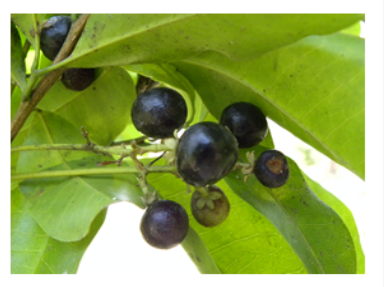
Figure 2: Fruits of E. paniculata