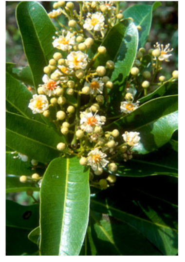
Figure 1: E. paniculata Flowers