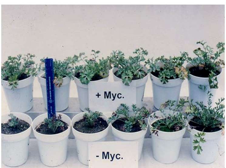
Figure 2. Pyrethrum chrysanthemum ( Tanacetum cinerarifolium) plants grown with (+ Myc.) and without (- Myc.) beneficial, root-inhabiting fungi across a range of phosphorus fertilization from low (left) to high (right). 'Myc.' abbreviates 'mycorrhiza' which literally translates as 'fungus root,' the name given to the absorptive organ jointly formed by roots and ancient, Glomeromycotan fungi.

Having crop plants that efficiently use phosphorus proffered by root-inhabiting fungi brings with it a second challenge which is the need to make sure that the fungi are present and available to associate with roots. Unfortunately, so far no one knows how